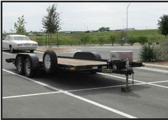
Best Tool for a Dropped Valve Seat

Corvair Houston 1907 Iron Ridge Sugar Land, TX 77478-4116