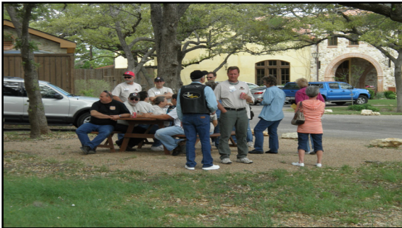
Rest stop at the Winery along the Cruise